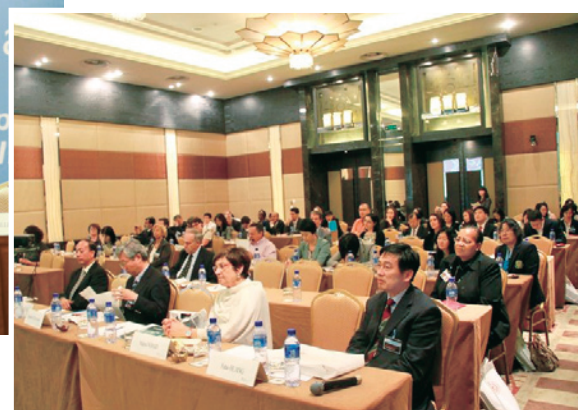
5 th International Forum (Shanghai, Oct. 2010)