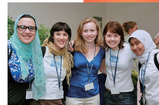
3 rd Student World Forum (Chemnitz, June 2009)