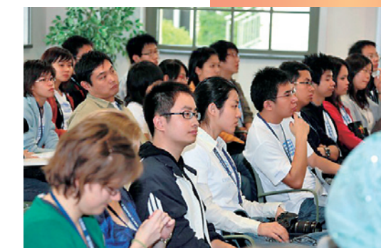
3 rd Student World Forum (Chemnitz, June 2009)