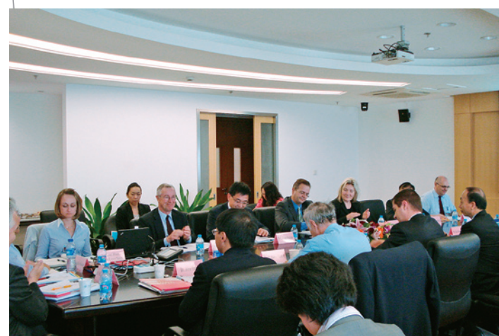
8 th Steering Committee (Shanghai, Oct. 2010)