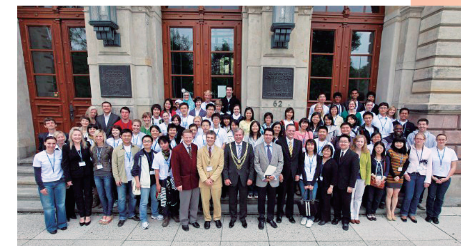
3 rd Student World Forum (Chemnitz, June 2009)