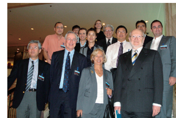
4 th General Assembly (Shanghai, Oct. 2010)