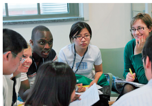
3 rd Student World Forum (Chemnitz, June 2009)