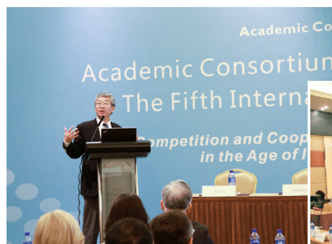
5 th International Forum (Shanghai, Oct. 2010)

The principal theme of the inaugural forum, "The Role of Universities in the 21 st Century", continues to guide AC21's activities to this day. In an era of continuous change, we believe that institutions of higher education must take the initiative in responding to the rapidly transforming needs of society, and that an international university network, with its common pool of knowledge, expertise and experience, comprises the optimum means to accomplish this. As demonstrated by the scale of our projects and activities, AC21 is firmly committed to contributing to the global knowledge sector.